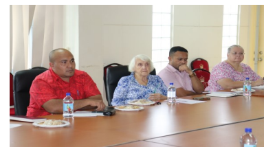
Above Photo-Tax Agent Members