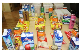
Above Photos-Prizes to be awarded

A huge “THANK YOU” for the Return and Dept Collecting Team for hosting this month's raffle .