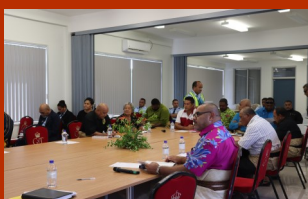
Representatives from District and Town Officers.