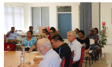
Above Photo- Members of Tonga Chamber of Commerce