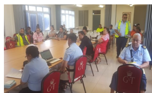
Representatives from Broker Businesses

The core focus of this meeting was to educate and remind Broker Businesses the policies at the Customs Controlled area.