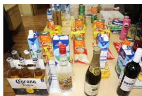
Above Photos-Prizes to be awarded