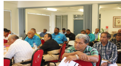
Top Photo-Fellow District & Town Officers representatives.