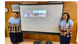
Virtual E-Tax Trainings—Total Fiji