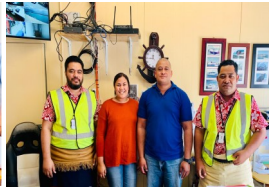
Pacific Sunrise Enterprises— LTO