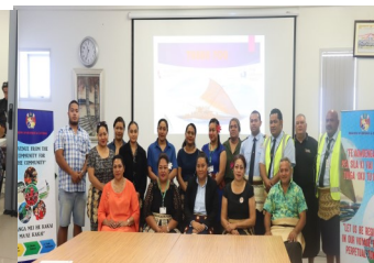
Participants from Tonga Chambers of Commerce Indus-

"Let us be resilient in our voyage for a perpetual Tonga"