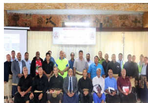
Participants from District & Town Officers Forum

The focus of this program was to introduce the core functions of the Ministry and the latest updates of Revenue & Customs and Tax Week 2020 as well as building an active relationship that will be beneficial not only for the government ministries but the people of Tonga.