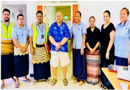
Friendly Island Shipping Agency-LTO