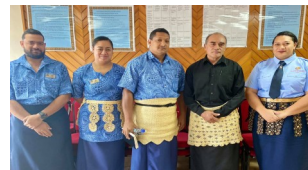
E-tax Trainings -Tonga Water Board

Should you have any queries or require assistance with any training arrangements or for Client Services assistance, please contact our office 26432 or email cst@revenue.gov.to