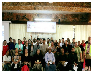
Participants from Youth