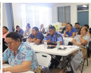
Participants from Account & Payroll Officers