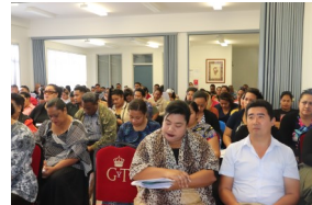
Above-Participants from Risk Profiling Workshop