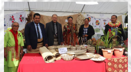
Photo Above: The CEO of the Ministry together with some of the Ha'ateiho residents.