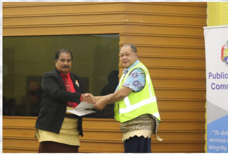
Photo Above: CEO receiving a certificate of Recognition from Deputy Commissioner Kolokihakaufisi for participating in the Best Practice conference held at Fa'onelua Convention Centre