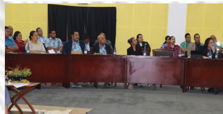
Photo Above: Public Service Servants from different line ministries attended the Best Practice Conference

The Public Service Commission week started on Wednesday the 4th of August with a TONGA BEST PRACTICE CONFERENCE held at Fa'onelua Convention Centre. The Ministry of Revenue and Customs was one of the nine Ministries registered to present its Best Practice Approach at this conference. Hon. Dr. Rev. Pohiva Tu'i'onetoa, The Prime Minister of Tonga, delivered the opening address, followed by presentations from the nine registered Line Ministries.