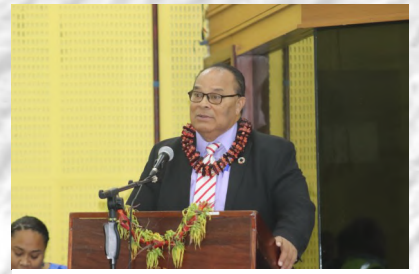
Photo Above: Hon. Dr Rev. Pohiva Tu'i'onetoa, the Prime Minister of Tonga delivered the opening address