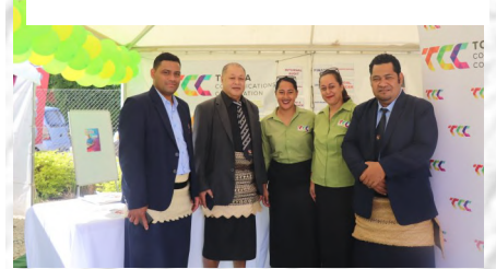
Photo Above: The CEO of the Ministry together with staff of Tonga Communication Cooperation.