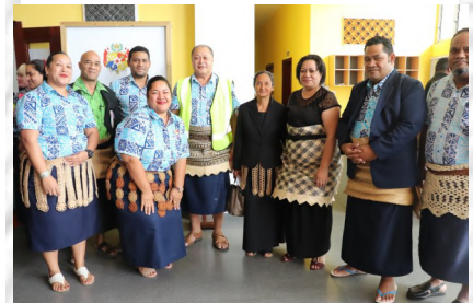
Photo Above: CEO for Revenue & Customs, Acting CEO for MAFFF and CEO of the Commission with some of the civil servants who attended the Best Practice Conference.