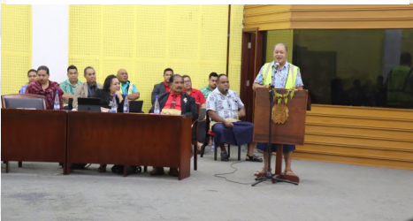
Photo Above: CEO presenting MoRC's "KAFATAHA APPROACH" best practice