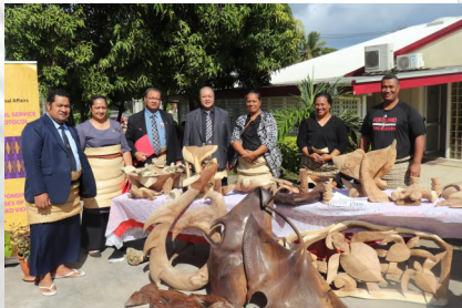
Photo Above: Owner of Mata'u 'o Maui with the CEO and staff of MORC.