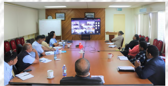
Photo Above- Participants from Tonga Tax Administration.