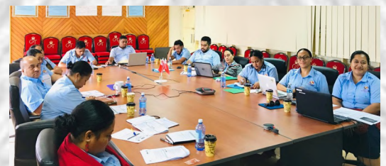
Photos Shown: A meeting embarking the four day virtual trial to improve tax payer services