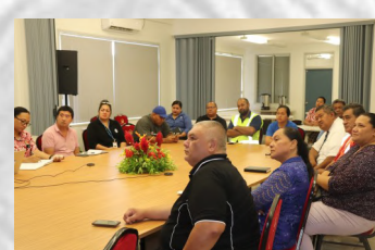
Pictures Above: Ministry of Revenue and Customs team including PFTAC advisors and our Customs brokers.