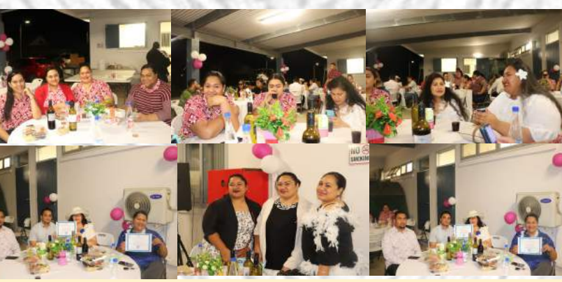
It's that time of the year, we celebrated the achievements throughout this quarter with an enjoyable event. Revenue and Customs mark this event by acknowledging those who achieved internal/regional pieces of training and staff of the months. MORC continues to uphold its commitment to excellence in implementing a good job.