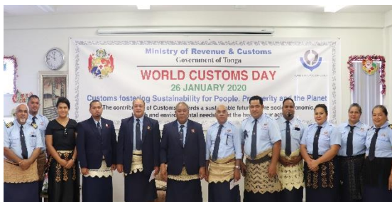
The Ministry of Revenue & Customs Heads of Department and Senior Officers.