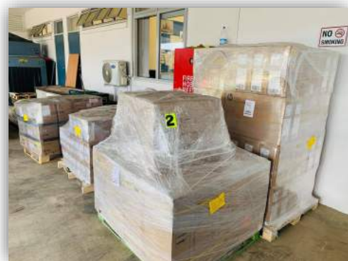
Photo Above: Receiving the ICT Infrastructure packages at Fe'aomoengalu .

The Government of Tonga has contracted Christchurch-based, New Zealand ICT Company Server Works Limited to implement this project. Server Works Limited has vast experience in providing ICT support and solutions in the Asia Pacific region. The good news is, Server Works Limited should complete this project by early August, and our customers and stakeholders can expect a much more efficient ICT infrastructure to serve their needs. The implementation of this project is also being made possible with the assistance of MEIDECC, Tonga Communications Corporation (TCC), Tonga Airport Ltd, and Ports Authority Tonga Ltd.