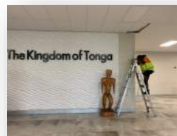
Photo Above: Updating data backup @ Fua'amotu International airport.