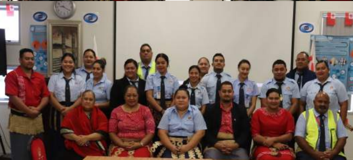
Participants -The Customs & Trade Division of the Ministry of Revenue and Customs officers together with MEIDECC.

The Customs & Trade Division of the Ministry of Revenue and Customs and MEIDECC conducted a refresher training program for Customs Brokers and Customs Officers about ODS regulations and their enforcement to bolster Tonga's regulation of trade in refrigerants and, in particular, ODS. Ozone-depleting substances (ODS) such as chlorofluorocarbons (CFCs) and hydro chlorofluorocarbons (HCFCs) are also greenhouse gases. Therefore, the phase-out of ODS under the Montreal Protocol has contributed to and will continue to mitigate climate change. In addition, HFCs that are ozone friendly and therefore used as alternatives to CFCs and HCFCs are also greenhouse gases. CFCs, HCFCs, and HFCs are still used in our daily life. Consequently, it is vital to control the emissions into the atmosphere for the prevention of climate change.