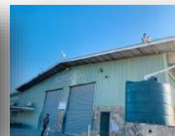
Photo Above: Updating databack-up @ Queen Salote Wharf.