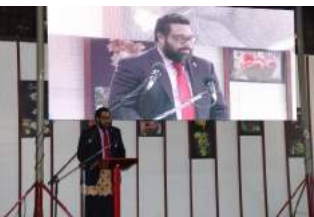
Photo Above: A speech was then followed by the guest speaker of the Legislative Assembly – Lord Fakafanua. He addressed the participants with the theme "Drugs – our biggest problem." He emphasized the critical roles of Revenue and Customs officers in revenue collection and safeguarding Tonga's borders to address the rising problem of drugs in society.