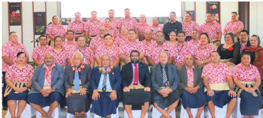
The Honorable guest of honor Lord Fakafanua, Minister of the Ministry of Revenue and Customs Hon. Tevita Lavemaau, CEO and the rest of the Senior Revenue officers are participants of this retreat program.