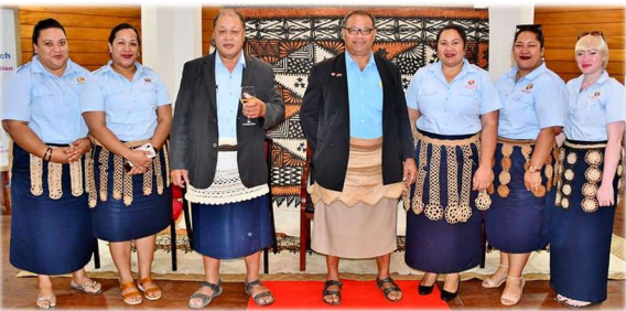
PMS TEAM attending a Dedication Program for the revamped PSC Office

Ongoing refresher trainings is scheduled for the rest of the month and also beginning of the new FY. The performance of employees is assessed based on what they have achieved (results) compared with outputs they had agreed to with their supervisor as per Columns A&B of Section 3.1 & 3.2 of the PMS form. As such, employees are advised the appropriate performance rating should be allocated based on what the employee has delivered as measured against the KPIs. MORC continues to uphold its commitment to excellence in implementing the PMS within the Ministry and still achieve Green Traffic Light Colors for all 3 quarters of the FY 20/21. The last quarter feedback will be received in July.