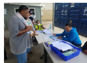
Above Photos: Citizens of Tonga picking up cargo from QSW Wharf.