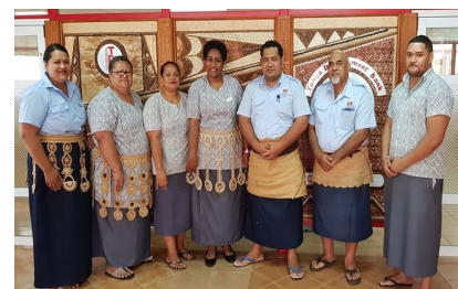
Staff of Tonga Development Bank (Heilala Members)

⇒ The Church of Jesus Christ and Latter Day Saints