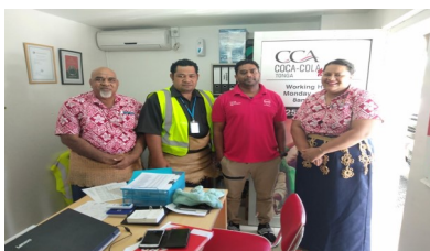
Staff-Coca-cola Amatil Tonga.