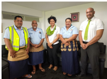
Staff -Bank of South Pacific Tonga Limited