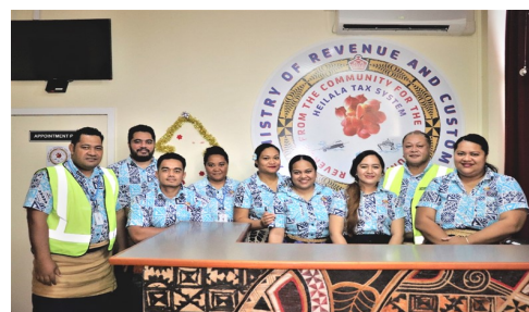
Left Photo: Large Taxpayers Office Team