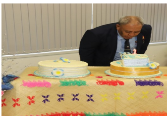
Left Photo : Hon. Tevita Lavemaau the Minister for Revenue and Customs.

The Honorable Minister for Revenue and Customs Tevita Lavemaau with staff (Custom Division) at the Custom Office marked it's first Anniversary of the Fe'ao-moe-ngalu Building with a prayer service on the 1 st of June 2020.