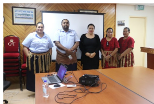
Staff of Ministry of Land , Survey and National Re-