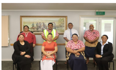
Staff-The Church of Jesus Christ and Latter Day Saints