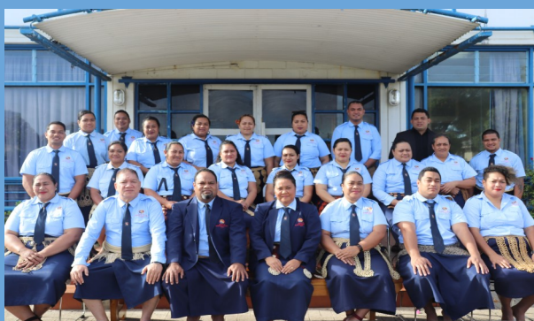
Above Photo : Tax Compliance Improvement Team 2020/2021

We will strive for excellence by working accordingly to the Ministry's vision "To be recognized as the best Ministry amongst all Government Ministries" and mission "To establish and promote highest standard of professionalism and good working relationship with all stakeholders."