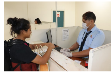
Above Photo - From the airport counter.