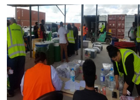
Above Photos: From QWS Wharf offloading Cargo.

f. All grants from Government and public international organizations and development partners to businesses, employees and any other taxpayer in relation to the combating of the COVID 19, are exempt from income tax.