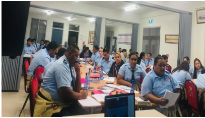
Participants from the Professional Training Course