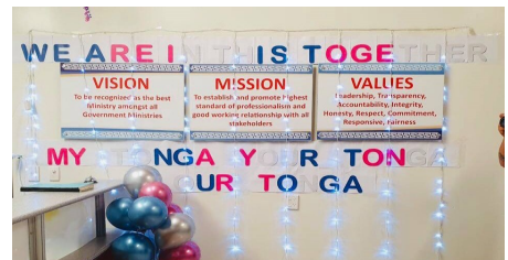
Above Photo-Customs Office supporting PSC DAY by decorating our office with PSC theme