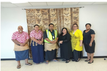
Staff -Fexco Tonga Limited