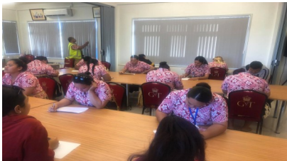
Participants from the Professional Training sitting their exam