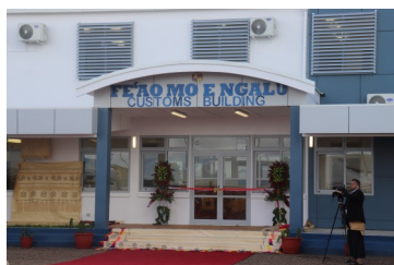
Right Photo : Fe'aomoengalu building one year ago.