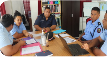
With the finance managers and accounts of Tonga Fire & Emergency Services.