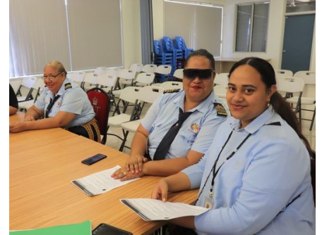
Above Photo: Customs frontline Officers at Fua'amotu Airport.