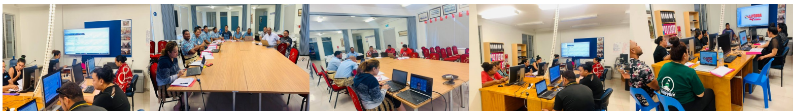
Above Photo: Training with the Shipping Agent

On the 14 th April 2021, approximately 5 months into the Project, Tonga Customs launched its first Training program for the private sector and Customs officers under the Project. The first module of the training will cover the Manifest module of ASYCUDA World system and is expected to run over 2 weeks. Participating in this first module are Airline and shipping agents as well as freight forwarding agents and Customs officers.