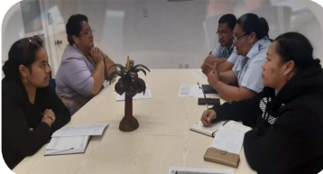
With the finance managers and accounts of the Ministry of Tourism.