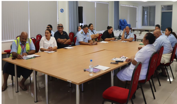
Above Photo: Customs frontline Officers at Fua'amotu Airport.