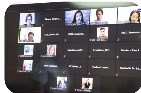
Participants –All members of Pacific Islands Tax Administration Associations

This webinar was to discuss the domestic resource mobilization (DRM) and fiscal policy in the region. The Revenue Statistics in Asian and Pacific Economies aims to improve the quality, consistency, comparability and accessibility of revenue data for countries in Asia and in the Pacific and is a crucial information base to support tax policy and tax reform in the region. In 2020, the initiative produced harmonized revenue data for 21 economies in Asia-Pacific, presented in an annual publication and an online database. Revenue Statistics in Asian and Pacific Economies is part of the Global Revenue Statistics Initiative, which covers more than 100 economies in the OECD, Asia-Pacific, Africa, and Latin America and the Caribbean. Revenue Statistics in Asian and Pacific Economies is jointly produced by the Organization for Economic Co-operation and Development (OECD)'s Centre for Tax Policy and Administration and the OECD Development Centre with the co-operation of the Asian Development Bank, the Pacific Island Tax Administrators Association, and the Pacific Community and financial support from the governments of Ireland, Japan, Luxembourg, Norway, Sweden, Switzerland and the United Kingdom.. The senior officers of the Ministry of Revenue and Customs participated in this meeting.