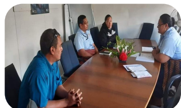
With the staff of the Ministry of Education and Training

The more we talk, the clearer it will be.