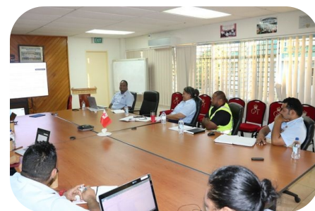
Participants - Senior Revenue Officers (Revenue Division)

"Let us be resilient in our voyage for a perpetual Tonga"