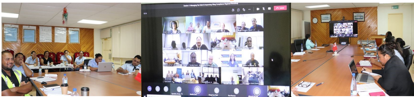
Participants -Managing Tax Debt & Improving Filing Compliance Regional Workshop.

The Pacific Financial Technical Assistance Centre (PFTAC), Pacific Islands Tax Administration Association (PITAA) and International Monetary Fund (IMF) hosted a virtual workshop to discuss why filing, payment/collections and arrears management is important at the Ministry's office (Revenue Division).