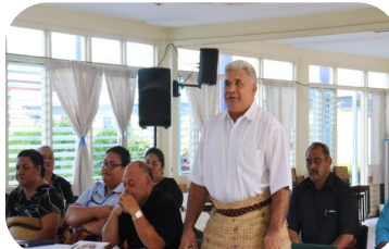
With the finance managers and accounts of the Free Wesleyan Church of Tonga.