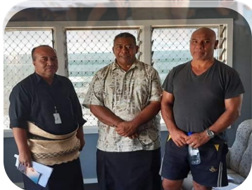
With the finance managers and accounts of Anga'ofa Timber.