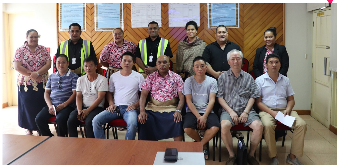
Selected Businesses to Pilot the implementation of Sales Register along with Revenue Officers