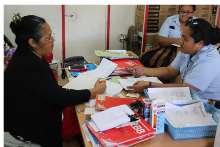
Assisting Tax Payers with Tax Matter