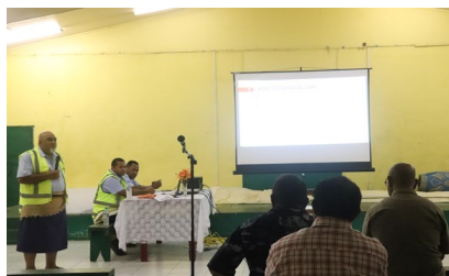
'Esafe in Pacer Plus awareness