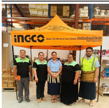
Luna'eva & Sons Company Ltd.