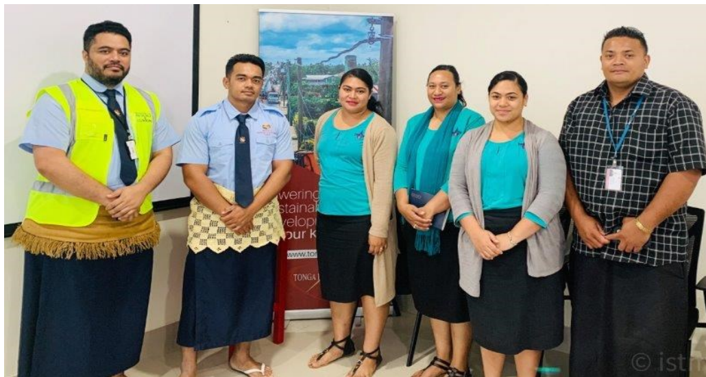
Friendly Visits held by LTO officers to Tonga Gas