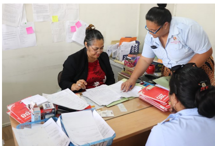
Pacific Trade Link- Toe Talatalanoa