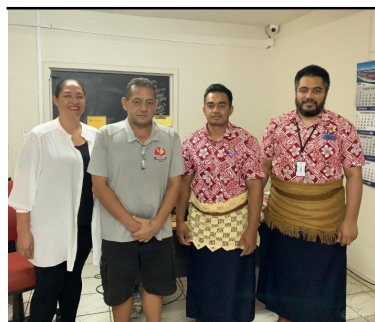
Matalupe Co.Ltd Visits