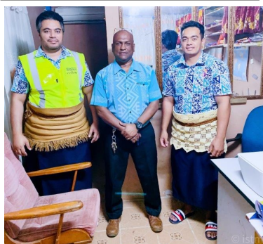
'Ana Gift Shop & Anna's Building Supplies