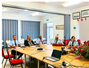
CEO and HOD in OCO