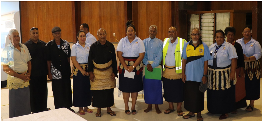
Customs Officers PACER PLUS Awareness