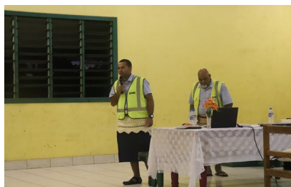
DCEO in Pacer Plus awareness

PACER PLUS More than Just a Trade Agreement