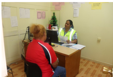
Help desk Support