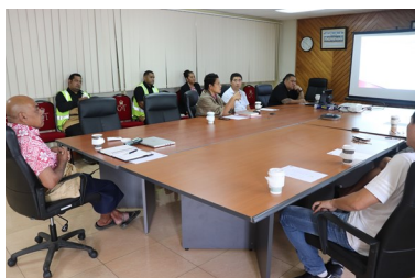
Sales Register Training